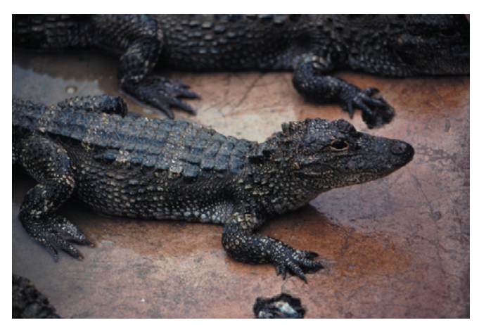
Figure 2. Captive A. sinensis.

Since 1979, Chinese alligator management focused on captive breeding, and centers were established in Anhui and Zhejiang Provinces (Wan et al. 1998). The Anhui Research Center for Chinese Alligator Reproduction (ARCCAR) is the largest facility, housing over 10,000 A. sinensis and serving as the administrative center for alligator management in Anhui Province. A 43,300 ha reserve for A. sinensis was established in Anhui Province in 1982 and promoted as the national nature reserve in 1986. From then on, the reserve, named the Anhui National Nature Reserve for Chinese Alligator (ANNRCA), covered a 5-county region and includes 13 protected sites that contained virtually all the remaining areas with wild Chinese alligators.