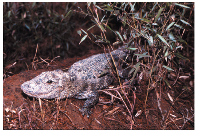
Figure 3. Alligator sinensis.

Following a review of management and conservation of A. sinensis (Webb and Vernon 1992), in 1992 the ARCCAR facility was registered with CITES as a captive breeding operation. The primary intentions expressed at the time of registration were to provide alligators for local meat consumption and live animals for the European pet market. Income from the trade of captive-bred alligators was mainly used to maintain and continue captive breeding and conservation activities.