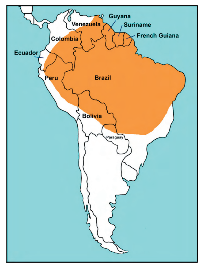
Figure 1. Distribution of Paleosuchus palpebrosus.

Range : Bolivia, Brazil, Colombia, Ecuador, French Guiana, Guyana, Paraguay, Peru, Suriname, Venezuela