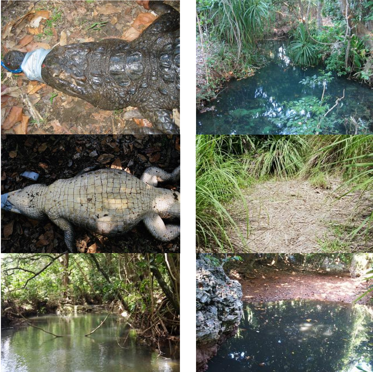
Counter clockwise from upper left: Dorsal side of head and neck of Dalupiri crocodile; crocodile underparts showing 25 ventral scale rows; Nipa Creek; one of few remaining puddles along Manolong River; old crocodile nest along Cabitangaan Creek; Caucauyan Creek.