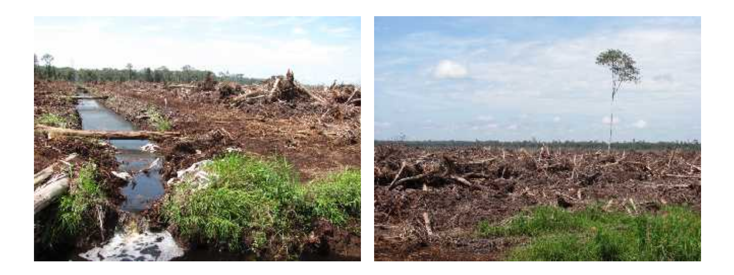
Figure 2. Peat swamp clearing (~400ha) for oil palm plantation in part of the North Selangor peat swamp forest.

Although the remaining NSPSF is largely contiguous, it has undergone considerable disturbance, modification and clearance over the decades, which continues to-date. Recently, 400ha of State land in the northeast was cleared and planted with palm oil (Figure 2). Approximately 6,500ha of the Raja Musa Forest Reserve has been severely degraded by a combination of continued drainage and forest fires. Approximately 3,500ha of this burnt area is now covered in lalang or baldy grass, imperata cylindrical (Parish 2002). The clearing and burning of forest has also allowed encroachment, settlement and agriculture in the forest reserve. Drainage canals continue to drain water from the NSPSF and feed water into the Tenggi River which contributes to the irrigation of 20,000ha of lowland rice grown downstream in the Tanjung Karang Rice Scheme.