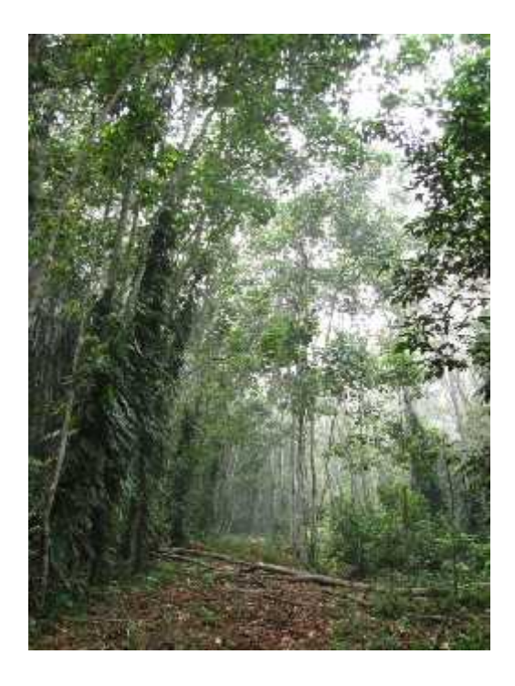
Figure 4. Peat swamp forest in the North Selangor peat swamp forest. Considerable logging has occurred here over the decades, but no logging since 2007.