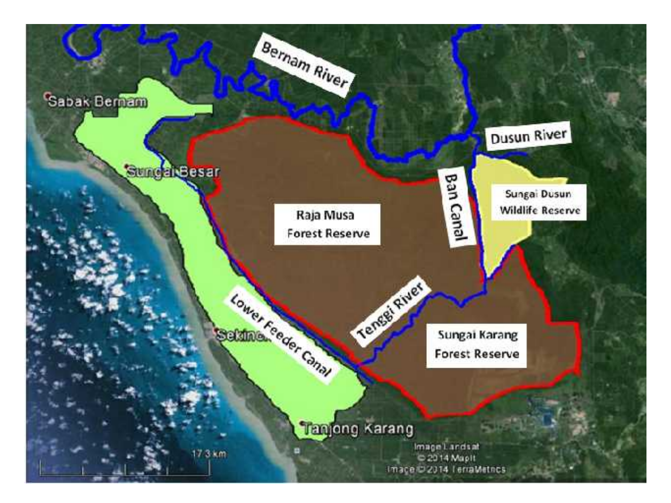
Figure 3. Map of the North Selangor peat swamp area, and various associated Reserves. Green area along coast is the Tanjung Karang Rice Scheme.

Although Tomistoma are generally associated with peat swamp and freshwater swamp forest (Stuebing et al. 2006), they are essentially restricted to the rivers and waterways within these forest types – especially at the drier times of the year. The main rivers (or sungai) of the NSPSF are now the Tenggi River and the associated artificial irrigation canals; the Ban canal and the lower feeder canal, and, to a lesser extent, the Dusun River which also flows along the northern edge of the swamp forest border (Figure 3, Figure 5). The Dusun River, no longer flows into the Bernam River as it once did. Its lower reaches were converted to palm oil decades ago, while the upper reaches are narrow, shallow and flow through mostly agricultural lands into the Ban canal.