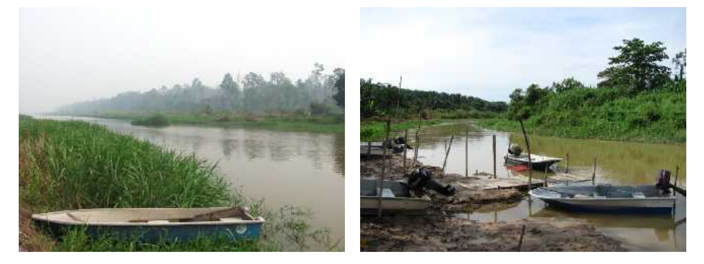
Figure 6. The Lower Feeder Canal (left) and the upper Ban Canal (right), man-made irrigation channels to provide water to the Tanjung Karang Rice Scheme near the coast.