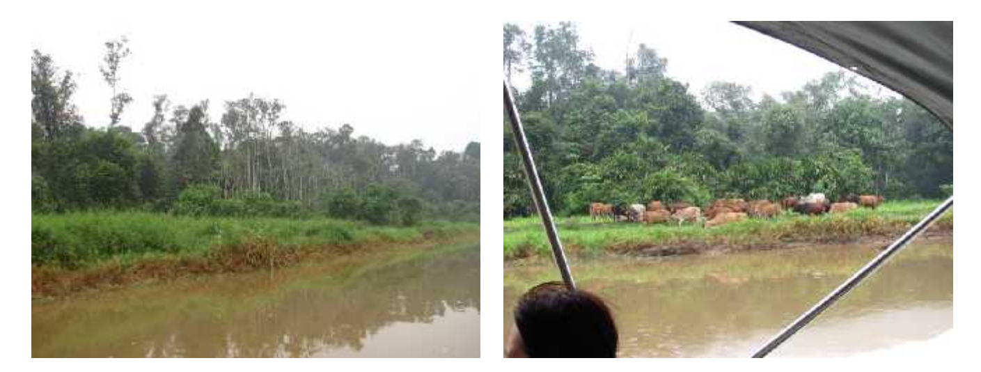
Figure 7. The Tengi River flows for more than 20km through the North Selangor peat swamp forest. Despite the banks being cleared of forest, the river still provides good habitat for Tomistoma. Cows graze the banks in the lower sections (right).