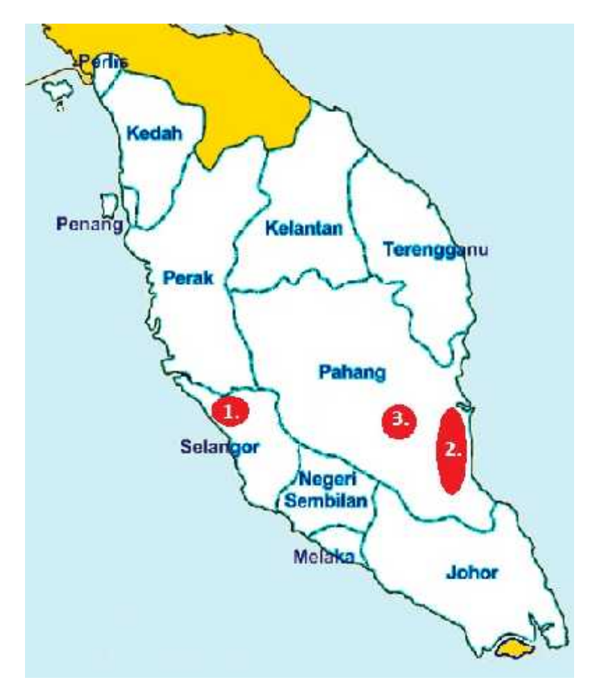
Figure 1. Main survey sites. 1 = North Selangor peat swamp forest, 2 = Southeast Pahang peat swamp forest, 3 = Lake Chini

Field surveys for Tomistoma focused on the areas in and around Peninsular Malaysia's two largest peat swamp forest blocks; the North Selangor Peat swamp forest and the Southeast Pahang peat swamp forest, within the states of Selangor and Pahang respectively (Figure 1).