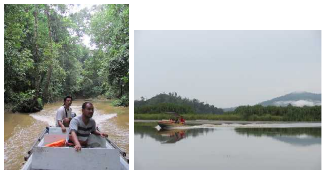
Figure 12. Lake Chini is surrounded by peat and lowland forest.

The timing of surveys was carried out to provide a preliminary appraisal and rapid assessment of the status of crocodilians in the area, and as such fieldwork was conducted during the drier times of the year when water levels were relatively low. In the North Selangor peat swamp forest, on the west coast of Peninsular Malaysia, surveys were conducted during June 2013. Surveys of the waters in the Southeast Pahang peat swamp forest on the east of the peninsula were conducted in November 2013, while surveys in central Pahang state were undertaken in April 2013.