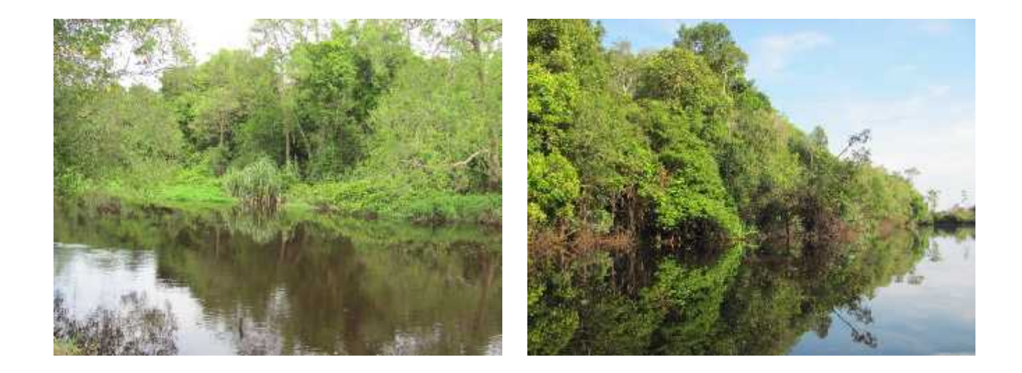
Figure 10. Peat swamp in the upper Bebar River, Southeast Pahang peat swamp forest. The upper reaches of the rivers are in good condition.

Agricultural areas border the banks along much of the rivers (particularly the Merchong River and lower reaches of the Bebar River) in the SEPPFS, with considerable areas being burnt in some places. Burning allows better access and conditions for the hunting, and prepares the area for agricultural activities. The natural peat swamp forests of the area are diminishing and being replaced with agriculture.