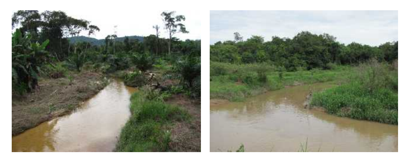
Figure 5. The Dusun River upstream (left) and its downstream confluence with the Ban canal (right).