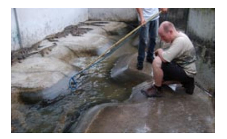
Figure 1. Careful selection of crocodiles at Palawan by René Hedegaard.

The five partner zoos have each donated funds for the conservation work of the Mabuwaya Foundation in Isabela Province. These funds have been used to set up and maintain a Philippine crocodile nest protection and head start program. In 2008, 6 nests were identified and protected in the wild, yielding 41 hatchlings of which 29 were collected for the head start program. Twenty-four juvenile crocodiles from 2006 were released back into the wild. The five Zoos have pledged to provide structural funding for in situ Philippine crocodile conservation, thereby directly contributing to a recovery of the wild C. mindorensis population in the Philippines.