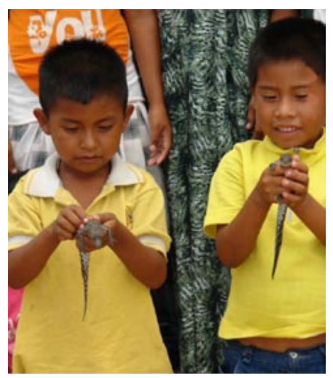
Figure 2. Wayuu children interact with C. acutus hatchlings.

This year, researchers will begin enhancing nesting conditions in order to further population growth of C. acutus . Activities include population monitoring, analysis of reproductive behavior, and comparing the results of artificial versus natural incubation. The researchers will continue to involve the Wayuu community throughout the various stages of the project. As a result of these initiatives, the Wayuu community along with its native C. acutus will continue to reap valuable benefits throughout and beyond the course of the research project.