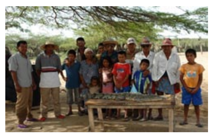
Figure 1. Meeting with the elders of clans that dominate Bahia Portete.

During the same first year, every effort was made to immerse the local community in the project (Fig. 1). Research leaders delivered presentations on the benefits of C. acutus conservation, and community members were encouraged to work on the project in conjunction with the research teams. In fact, among the Wayuu, C. acutus is a vital food resource and local hunting practice involves use of fishing nets as a means of capture.