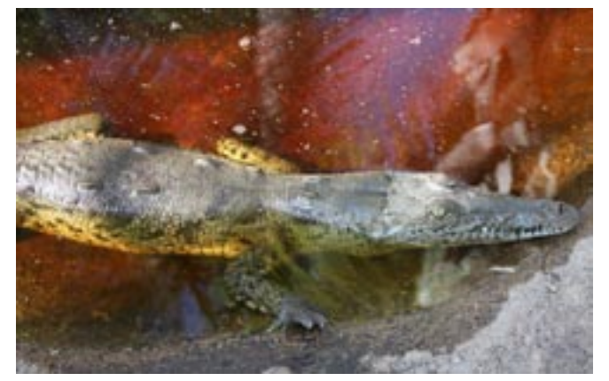
Figure 1. Atypical C. acutus showing anomalies in dorsal scalation and malformed jaws.

The crocodile was a female, with a total length of 109 cm. Although the animal had the typical skin colouration of C . acutus , the pattern of dorsal scales was quite atypical, with a complete absence of nuchal scales (usually 4), absence of 4 nuchal scales (usually 6), and the absence of many dorsal scales (Fig. 1).